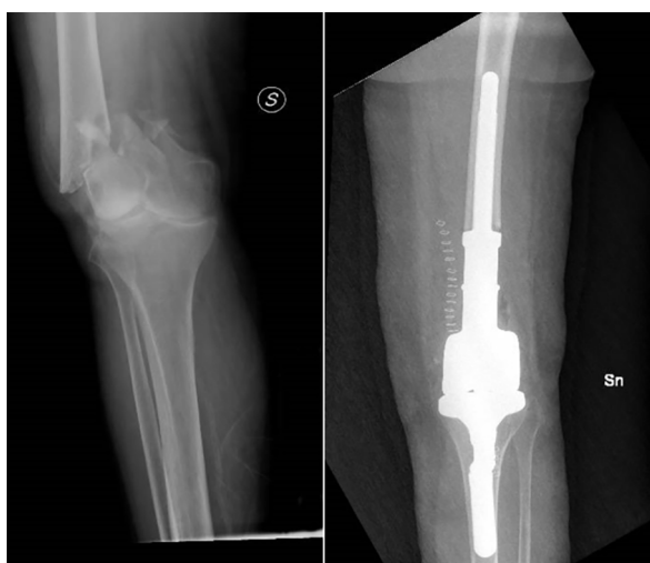
Figure 1. Ideal characteristic of the patient with complex fractures of the lower limbs eligible for Megaprosthesis.

hours were allowed to gradually weight bearing with the aid of a walker frame.