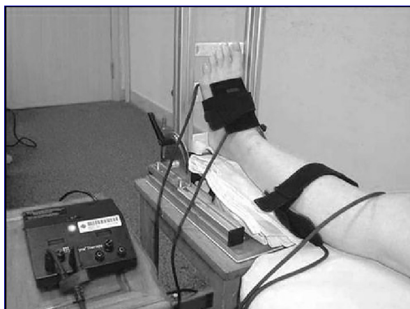
Figure 2. Application of MIRE.

Stabilization is important as any movement can result producing an adverse effect. The MIRE device was switched on, and the patient was instructed not to move the leg during the application. After the treatment session, the device was switched off, and the pads were removed. Any changes like redness in the skin were inspected. The temperature was maintained at 37°C for 30 min. This was done to rule out the possible confounding factor of the mild warming effect itself, rather than the photo energy of MIRE, on the blood circulation 35 .