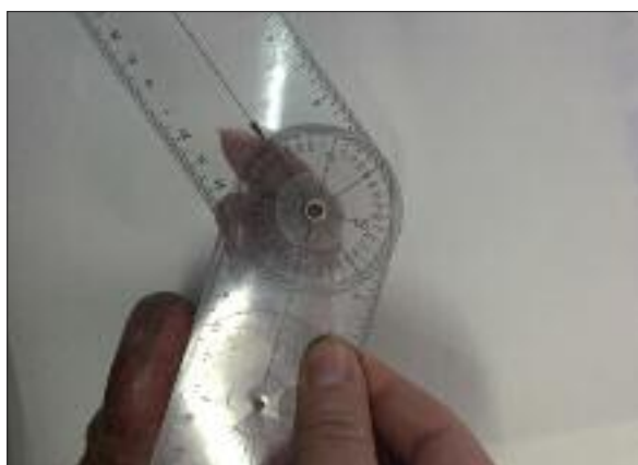
Figure 21. One month after 2 nd finger remnant PIP gains 40°, the third finger showing no significant gain modification in the last twenty days. Of course, complete skin scar discarding is needed. Meanwhile, to be stated whether a major issue has to be devoted to tendon and joints. Whatever the approach, we believe that an important both MP and PIP ROM has been gained, reducing the need for major dissections, and reducing further scarring.

Our results show that lipografting promotes regeneration also in tendon scars, and we propose