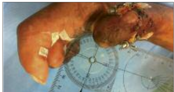
Figure 18. Ten days after 3 rd finger remnant MP gains 10°.