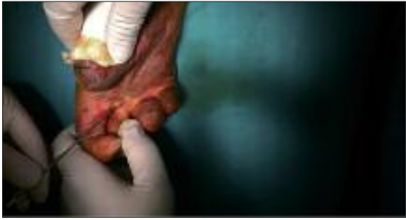
Figure 11. Whilst dissecting scars, ever protect neurovascular bundles remembering Hovius: many (how many!) microtreatments weaken chords and scar.