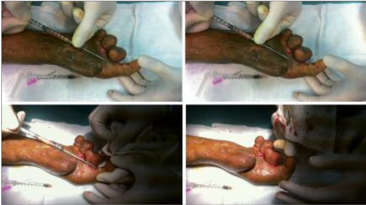
Figure 15. Injecting fat from proximal to distal.