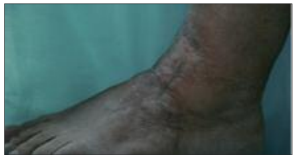
Figure 2. Tendon adhesions and scars of the dorsal aspect. The patient also complained of paresthesia in the territory distal to the scar.