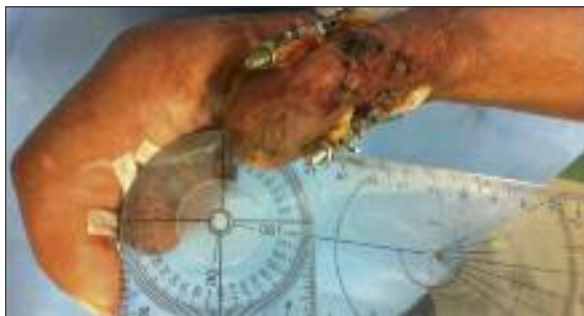
Figure 16. After the 3 rd lipografting session. Ten days after 2 nd finger MP gains 10°.