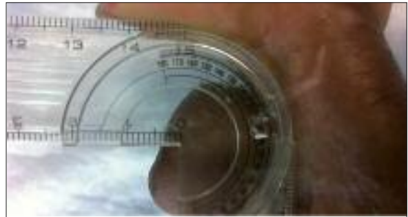
Figure 13. Before 3 rd treatment. 2 nd finger MP and IP ROM.

Adherences involving skin, tendons and bone, as produced by high energy or crush or