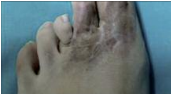
Figure 8. After 2 nd lipografting.