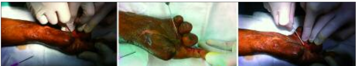
Figure 14. Scar dissection is easier in the third session.