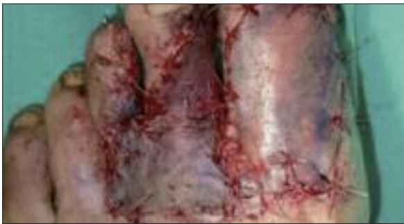
Figure 6. Result after bone reduction, covering with dermal regeneration template and STSGs.