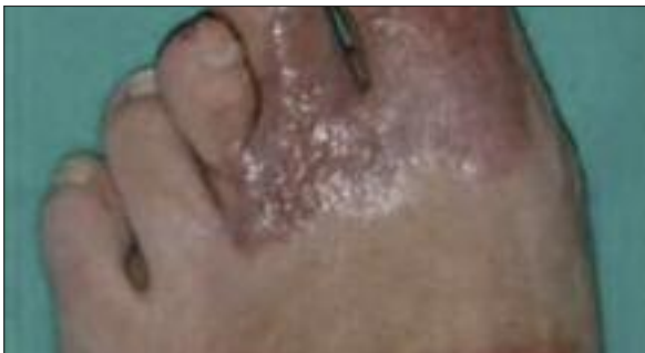
Figure 7. Scarring: Ugly retracting hyperpigmented scars are shown involving underlying tendon . After 1 st lipografting.