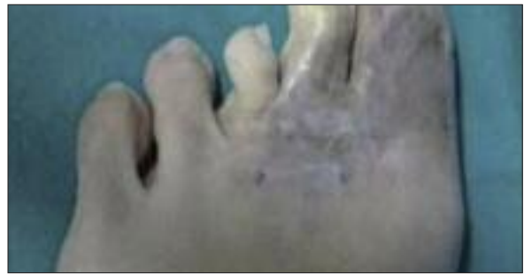
Figure 9. After 3 rd lipografting and ND/YAG LASER treatment.

Following Hovius et al 6 indication, limb exanguination with a tourniquet was achieved, and from proximal to distal, multiple scar puncture wounds were made with a fine needle-like, sharp-tipped, bevelled piercing instrument as described by the author's 6 , keeping the digit extended as far as possible, taking care only to release scar and not to touch neurovascular bundles. After the first session, scar dissection was easier to perform.