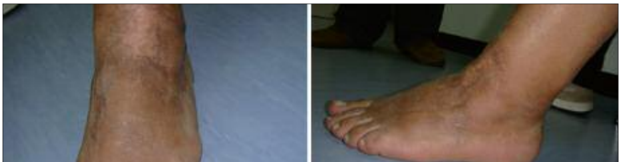
Figure 4. Two months after simple one step lipografting. A complete scar release together with important nervous recovery has been gained.