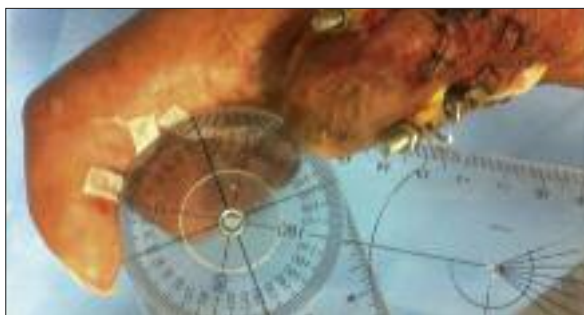
Figure 17. Ten days after 2 nd finger PIP gains more than 25°.