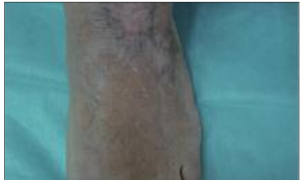
Figure 1. Our first two case: a painful retracting scar of the proximal forefoot from a farm accident.

We decided to start with lipostructure to release burn scar contractures involving the face, and to include this finger in our previous experience gained on the lower limb.