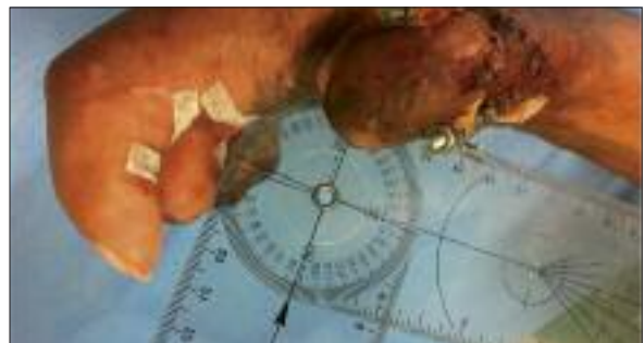
Figure 19. Ten days after 3 rd finger remnant PIP gains 6°.

even burns, are well known as an important surgical challenge, and in particular both hand and foot tendon compartments must be considered at high risk of developing retractile scars in-