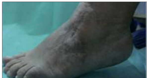
Figure 3. ROM limitation.