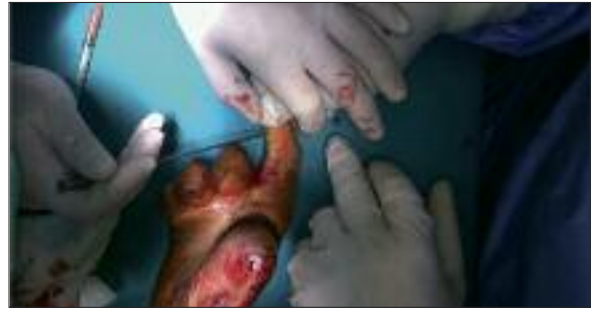
Figure 12. Perform and follow scar release completely from proximal to distal.

After two months a customized protocol of mobilization including passive and active ROM as well as skin stretching massages, was performed.