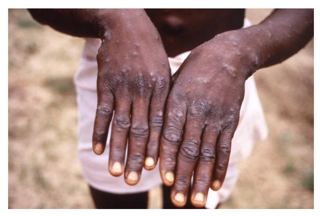
Figure 5. Monkeypox patient showing resolving lesions on the dorsal surfaces of the hands – courtesy PHIL-CDC.

sis of genetics and antigens, so vaccination with vaccinia can prevent monkeypox or reduce the severity of the disease. Monkeypox can cause severe life-threatening disease. The mode of transmission is by various ways such as from animals, direct/sexual contact, respiratory secretions or through the active lesions. Despite with 99.5% genetic similarity between the Western African and Central African strains, the Central African strain is comparatively very virulent with high mortality. To conclude monkeypox should be considered as a remerging disease. It is necessary to prevent this disease by vaccination using vaccinia. Precautionary measures like hand hygiene and the use of mask are very vital to prevent the spread.