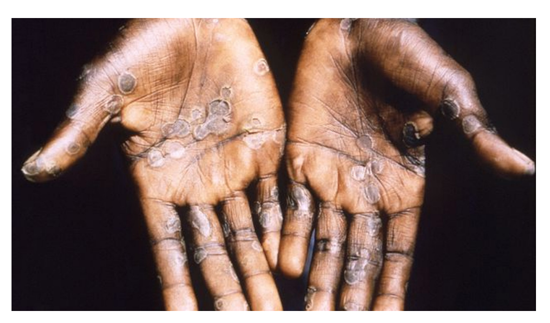
Figure 3. Scabs of monkeypox on the palms – courtesy CDC.

sexual and bisexual men due to the appearance of lesions in the genital and anal areas and the virus ability to transmit through intimate close contact<sup>14,28,29</sup>.