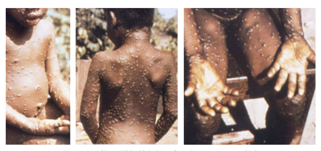
Figure 2. African child with lesions of monkeypox - courtesy CDC.

The difference observed between the old monkeypox cases and the recent monkeypox mainly lie in the mode of acquisition, all other aspects remain the same. Recent monkeypox cases outbreak in Europe included sexual transmission too apart from other modes of transmission. Monkeypox cases were observed predominantly in homo-