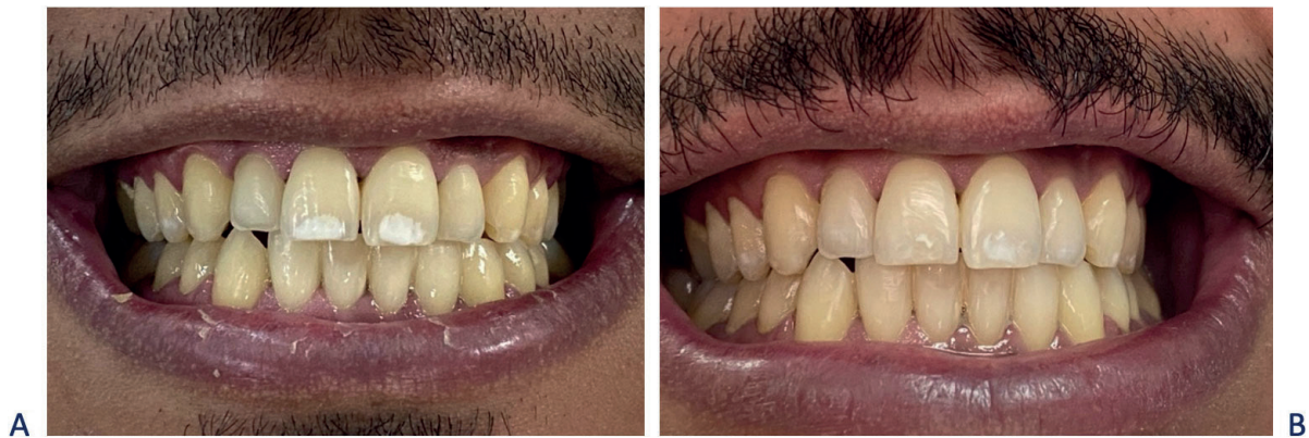
Figure 3. A, Smile before treatment. B, Smile after six months of treatment.

teeth. The refractive index (RI) of the sound enamel is 1.62, whereas the RI of the porous enamel is 1.33 when it is filled with watery medium and 1.0 when filled by air. More porous enamel increased crystalline spaces caused major variance in RI induces changes in the external scattering, resulting in the formation of white patches 14 .