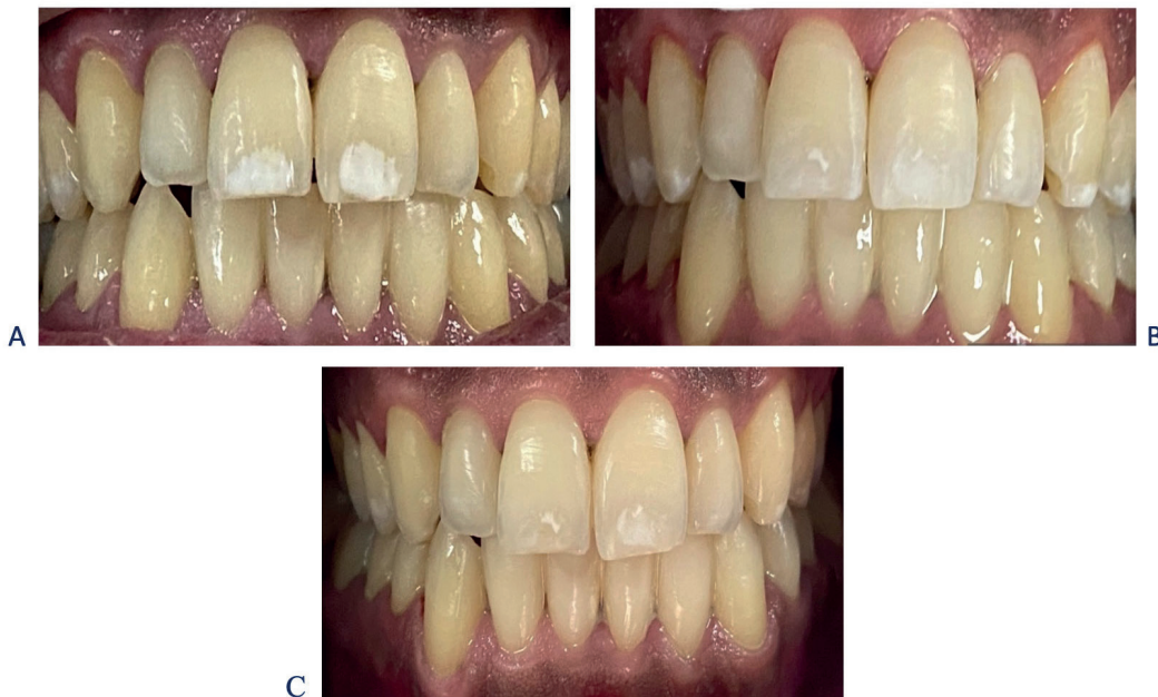
Figure 2. A, Preoperative photograph WSL in 11 and 21 teeth. B, Immediately postoperative photograph, after Microabrasion and Resin infiltration. C, Six months follow up after treatment.

Optical phenomena can be explained by the clinical appearance of enamel opacities on the