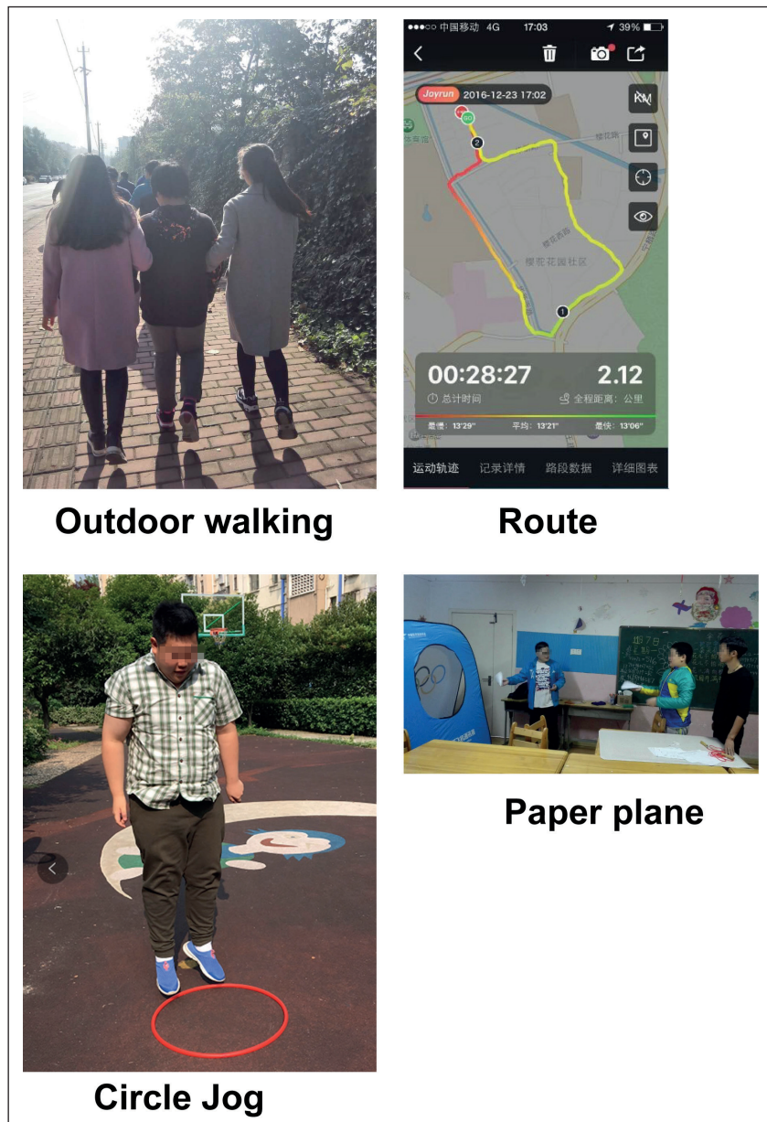
Figure 1. The content of the exercise-based interventions.

outdoor playground. The program included 4 sets of jumps, with 8 jumps performed per set. The time allotted was 30 minutes. During the exercise program, the operators constantly observed the participants and corrected their posture when necessary. After the exercise program, the op-