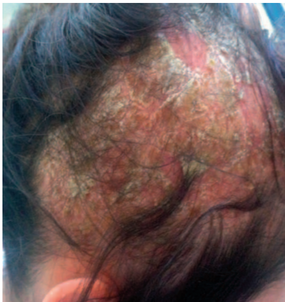
Figure 4. Progression with extensive alopecia.

have been postulated. One suggested mechanism is the activation of nascent autoreactive T-cells that cause psoriasis by means of altered immunity 9 . Moreover, it has been hypothesized that the pathogenesis of TNF antagonist induced psoriasiform lesions involves a disruption in cytokine balance by TNF blockade, allowing unopposed interferon-alpha ( INF\alpha ) production by plasmacytoid dendritic cells (PCDs) in genetically predisposed individuals 10-11 . INF\alpha is known to induce expression of the chemokine receptor CXCR3 on T-cells, which leads to recruitment of T cells into the skin 12 . T-cell producing TNF- \alpha causes psoriatic skin lesions 8,13 . Psoriasis is known also to have a strong genetic component with multifaceted mode of inheritance involving multiple chromosome loci 14 , and other polymorphisms could play a role in patients with this paradoxical response to TNF- \alpha blockade. Genome-wide association scans of psoriasis patients have also found variants in the gene encoding the interleukin-23 receptor, among other cytokines. Interleukin-23 receptor variants have also been identified in CD 14 . TNF antagonists have the potential to disrupt the delicate balance of gene products, cytokines, and chemokines that normally prevent the development of psoriasis in a genetically predisposed patient who would not have otherwise developed the skin condition. Some