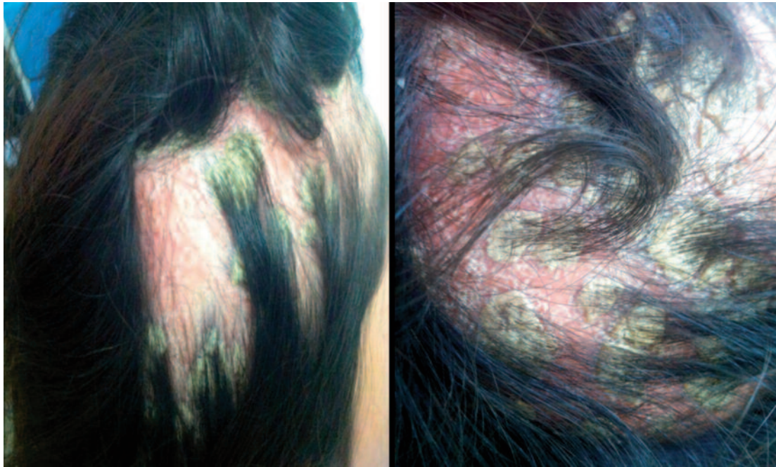
Figure 3. Diffuse erythematous scaly plaque on the scalp with severe hair loss.