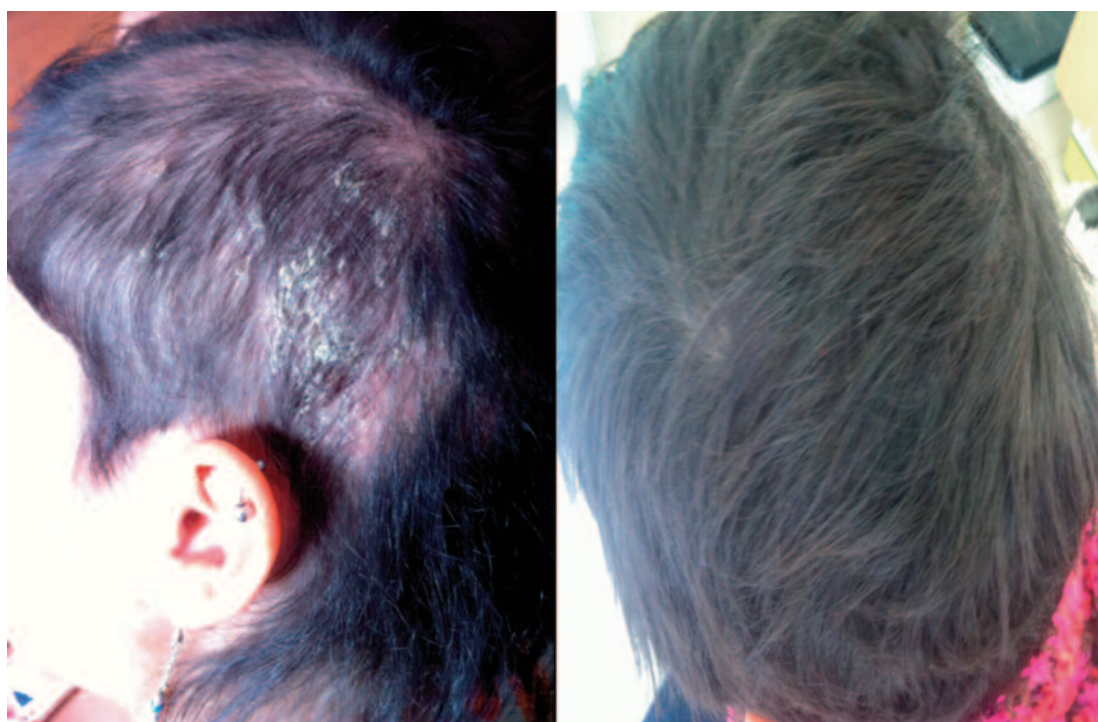
Figure 5. Complete remission of scalp psoriasis and alopecia after 6 months of treatment.

studies 15,16 have shown that the psoriasis was the most common adverse effect during anti-TNF, in particularly on infliximab, and the majority of patients were women, without personal or family history of psoriasis 15-17 . Several therapeutic approaches have been described for the case of paradoxical psoriasis subsequent to TNF- \alpha antagonists administration. The interruption or replacement of anti TNF- \alpha inhibitor led, regardless of concomitant disease, to the resolution of cutaneous lesions in 24% and in 15% of cases, respectively 10,18 . In other reviews 10,19 this strategy has been more successful, especially in IBD patients, with resolution of skin lesions after anti TNF- \alpha discontinuation in 46%-88% of cases, while in only 34% of patients without suspension of the biological 8 . These data must be cautiously interpreted, because anti TNF- \alpha withdrawal can determine the aggravation of intestinal manifestations 20,21 . IBD patients developing psoriasis during anti-TNF- \alpha therapy must be treated by conventional psoriasis approach (topical corticosteroids, phototherapy, vitamin-D analogs, methotrexate and/or cyclosporine) without the need to suspend infliximab. However, Buisson et al 22 showed that methotrexate does not appear effective in treating psoriasiform lesions associated with anti-TNF therapy refractory to topical thera-