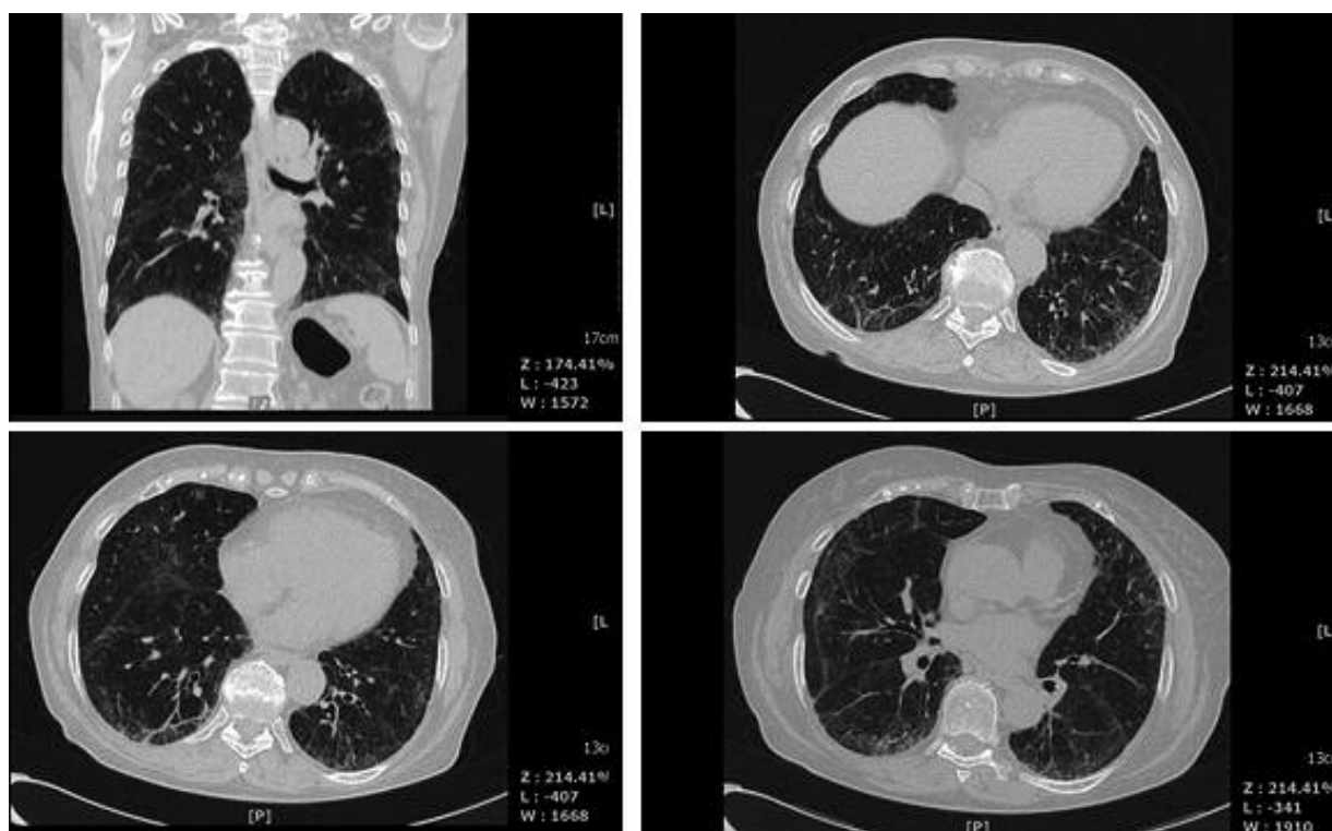
Figure 2. HRCT scan images (axial and coronal). One month after HU discontinuation, a significant reduction of pulmonary interstitial infiltrates is observed.

row suppression. Other side effects include gastrointestinal symptoms, stomatitis, impairment of renal tubular function, dysuria, transient elevation of hepatocellular enzymes, alopecia and rash 3 . HU-induced pulmonary toxicity is extremely rare: literature reported cases consists mainly of acute alveolitis or interstitial pneumonitis 8 . Interstitial lung disease may be related to infective or autoimmune diseases, environmental exposure, radiations, aspiration or idiopathic 17 . In our patient, HRCT findings were compatible with a diagnosis of interstitial pneumonitis, likely evolving into pulmonary fibrosis. An infectious cause was excluded, and an autoimmune nature was also ruled out. Also other possible causes of interstitial pneumonitis, such as environmental exposure or radiotherapy were excluded. The dramatic clinical and instrumental improvement after HU discontinuation and steroids tapering strongly support the diagnosis of drug induced lung injury. In the literature, previous cases of HU induced interstitial pneumonitis were also treated with HU cessation alone or with the addition of steroids, which can have a role in hastening resolution of ground-glass infiltrates associated with active inflammation 18 . In