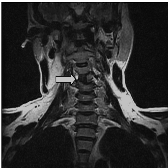
Figure 2. MR image, Fast Relaxation Fast Spin Echo sequence (FRFSE) T2-weighted (coronal). Results of C4 right hemilaminectomy.

probably are by themselves quite sensitive in the detection of osteoblastomas, but more thorough investigations such as CT scan and MRI are able to detect smaller lesions but with early symptoms, and also add important information for diagnosis and treatment 8,11,27,29,30 . CT scans can provide useful information regarding the size, precise localization, and any soft tissue extension of the lesion 31 . MRI is helpful for depicting the effects of the tumor on the spinal canal and surrounding soft tissues 30,31 . When doubts about the diagnosis persist, bone scintigraphy with technetium may be used, which is characterized by a greater sensitivity than the other techniques 27 . The differential diagnoses of osteoblastoma are multiple and include different types of benign bone tumors and tumor-like lesions 32 . Anyway, the most important differential diagnosis is osteosarcoma, which demonstrates greater cytologic atypia, permeative growth pattern or metastasis or infiltration into adjacent bone and/or soft tissue, and high mitotic rate 3 . Sometimes it can be very difficult the distinction between osteoblastoma and osteoid osteoma. Nevertheless, osteoblastoma is larger (usually more than 1.5 cm), tends to be more aggressive and can undergo malignant transformation, whereas osteoid osteoma is smaller, benign and self-limited 14 . Osteoblastoma tends to aggressive behavior, it sometimes attacks the nearby structures and rarely degenerates into osteosarcoma 33-35 . More-