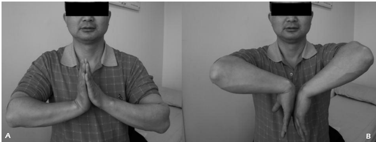
Figure 2. At the last follow up (case 2), the range of motion of the injured wrist was satisfactory (A, B).

pain was the most common cause of less satisfactory outcome. The flexion-extension arc at last follow-up was 129.8 \pm 27.0 degrees which was significantly better than the preoperative value ( 87.8 \pm 15.7 degrees) ( p < 0.01 ) (Table III). The postoperative radial-ular deviation arc also improved significantly ( 54.7 \pm 6.9 degrees, 34.4 \pm 6.2 degrees, respectively) ( p < 0.01 ). Grip strength was 90% of that of the normal hand at last follow-up and was better than the preoperative value (60%) ( p < 0.01 ).