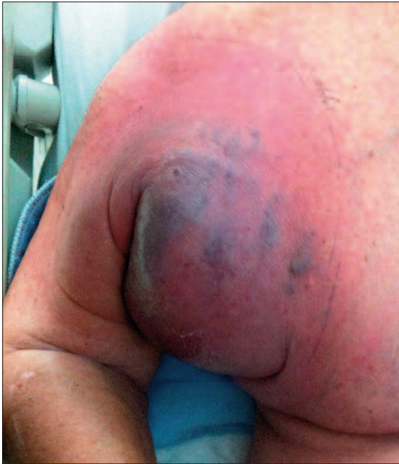
Figure 1. Erythematous and painful right axillary mass.

with core biopsy directed at the rind of the mass, yielded ample tissue that was sent for immunohistochemical staining, confirming the diagnosis of malignant melanoma.