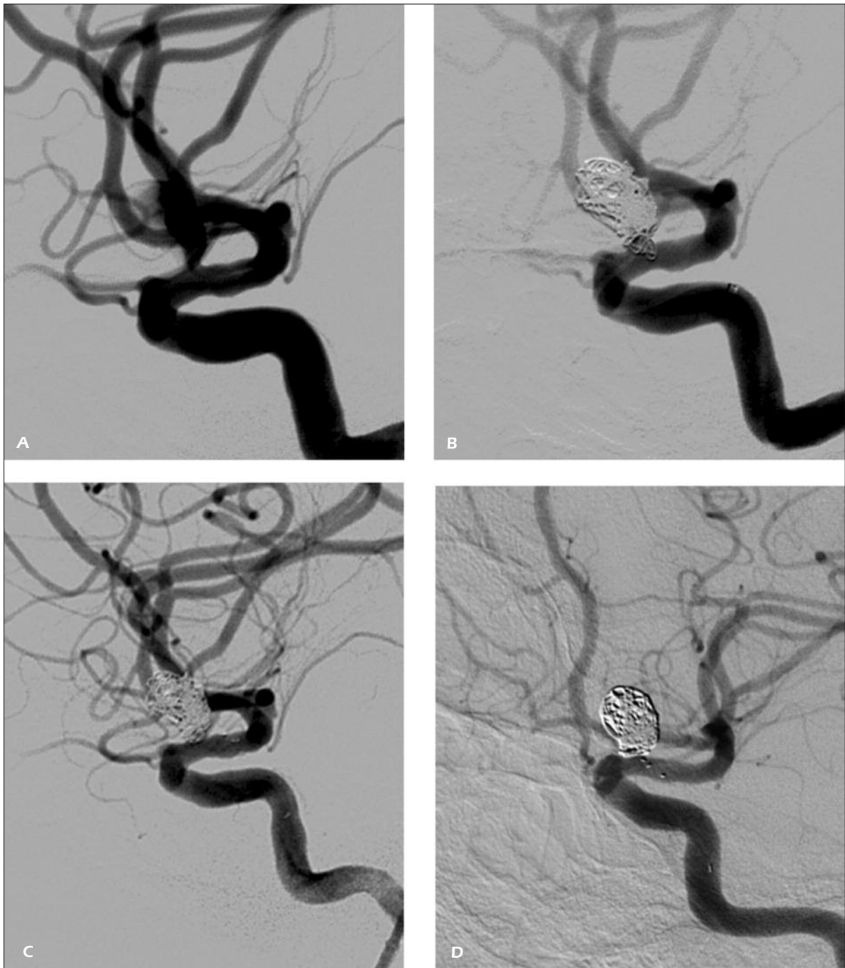
Figure 3. A , Pre-operative angiography shows a carotid-ophthalmic aneurysm. B , Intra-operative angiography shows the protrusion of coils to the parent artery. C , After the salvage stent placement. D , Angiographic follow-up 9 months after the surgery.

the NDS-2 professional detachment box, allowing for detachment both before and after the release of coils.